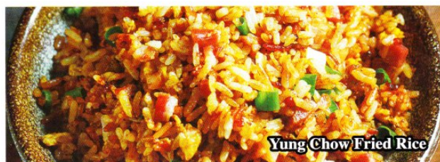
Yung Chow Fried Rice