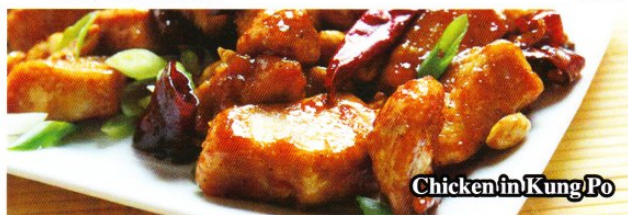
Chicken in Kung Po