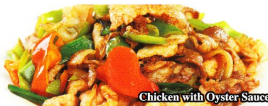
Chicken with Oyster Sauce